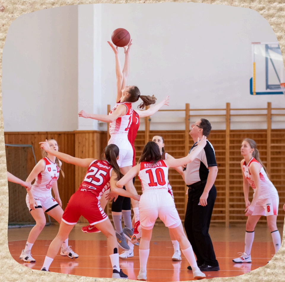
school sports events