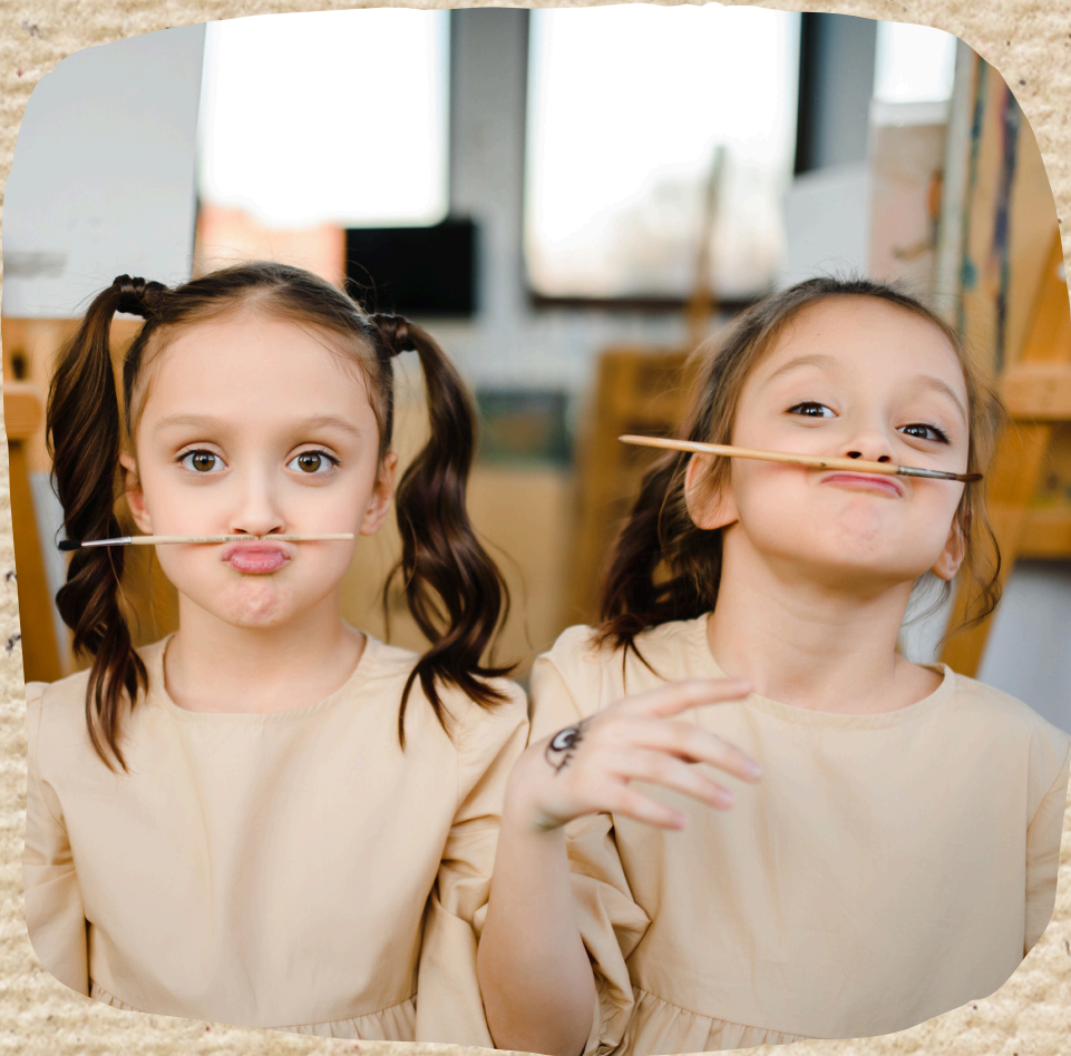
friends from primary school