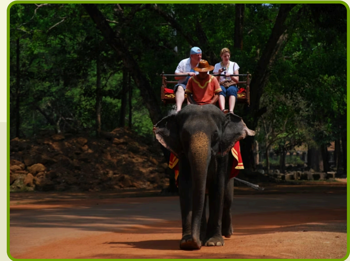
ride an elephant