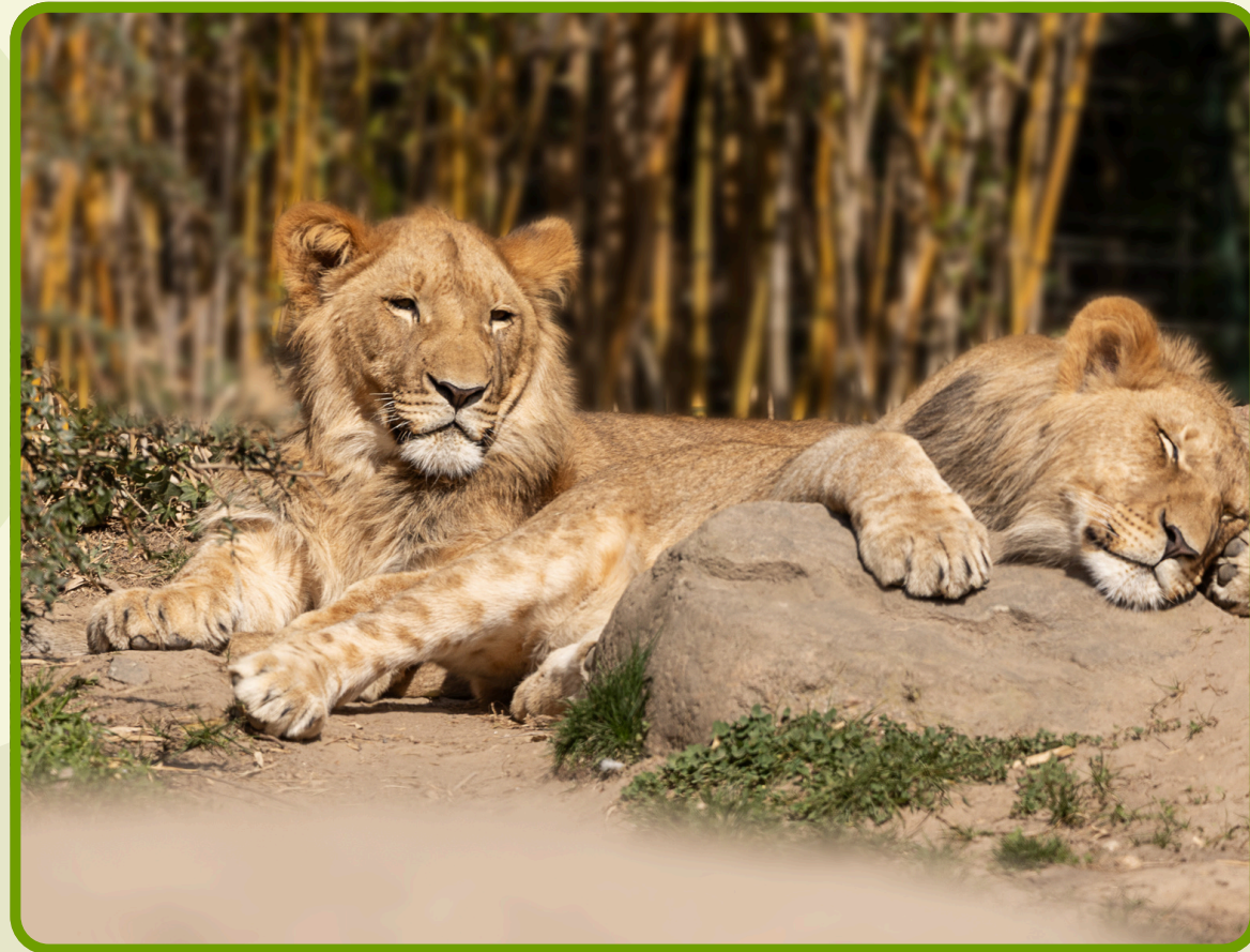
visit a zoo