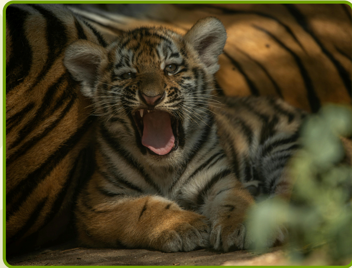
pet tiger cubs