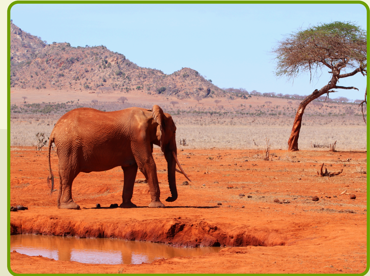
watch animals in the wild