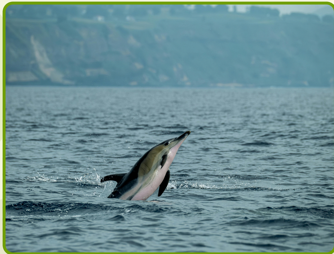
swim with dolphins