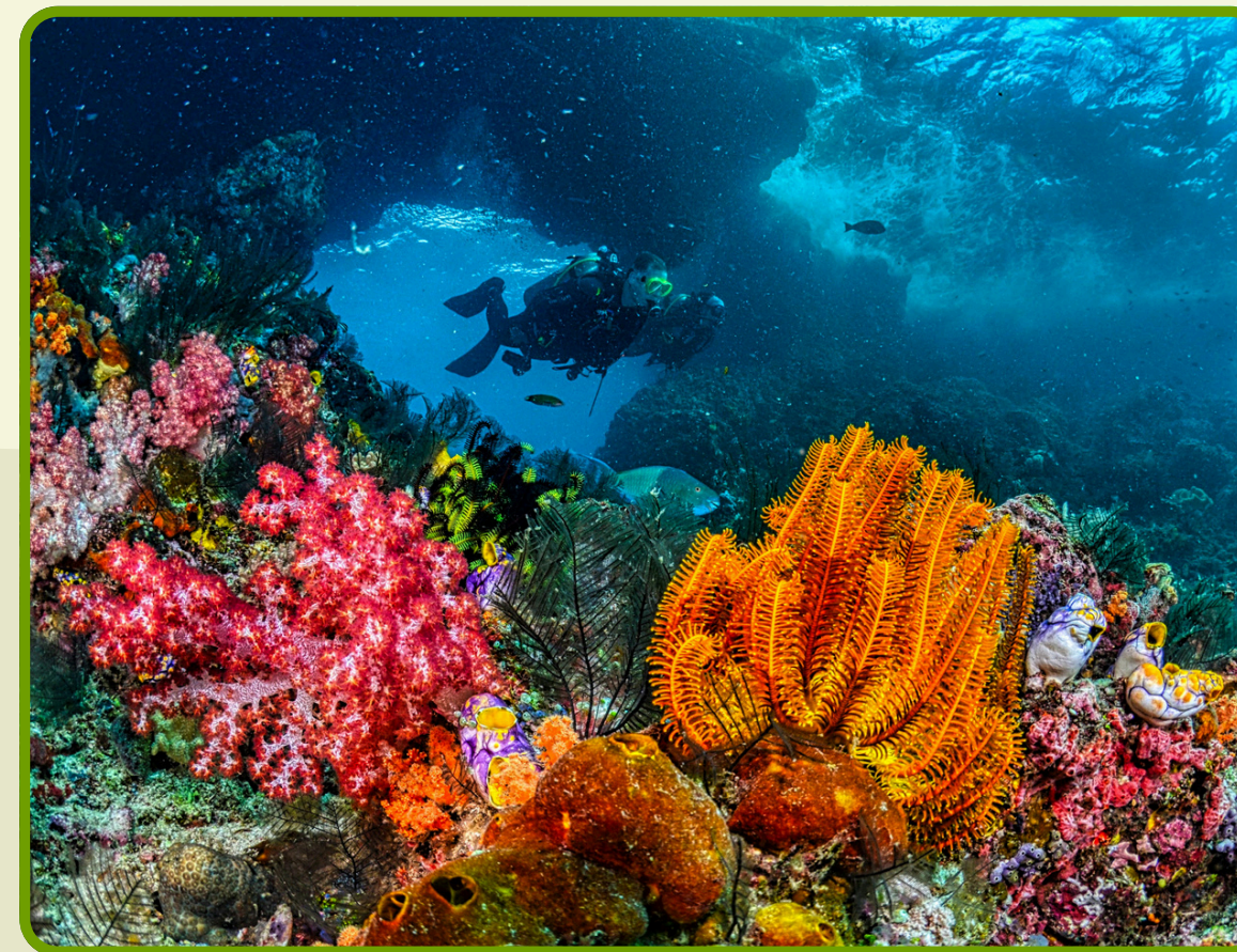
snorkel near coral reefs